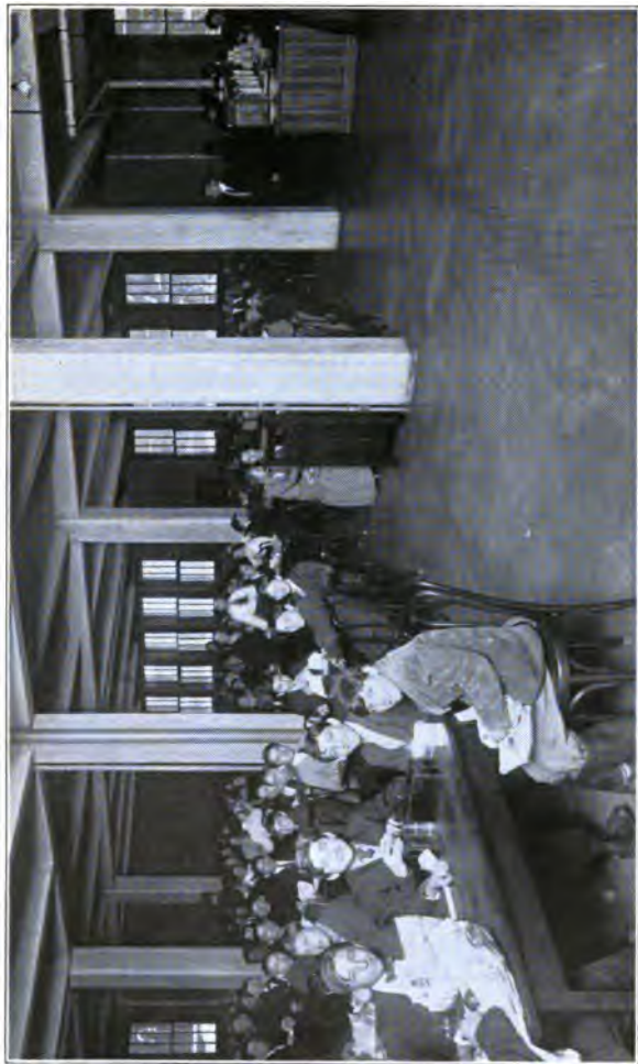
Basement lunchroom at East Technical High School. It accommodates about 500 children